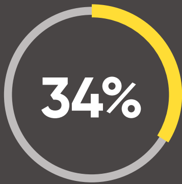
Brands being passionate about the products or services they sell